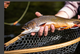
Beautiful Wild Brookies