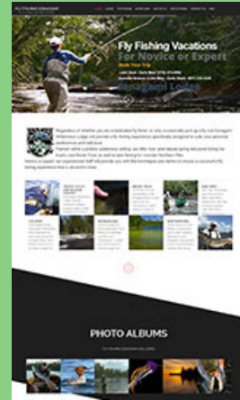
Fly Fishing Esnagami